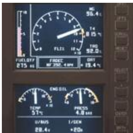
VEMD ® :

Vehicle engine monitoring display with first limit indicator (FLI)